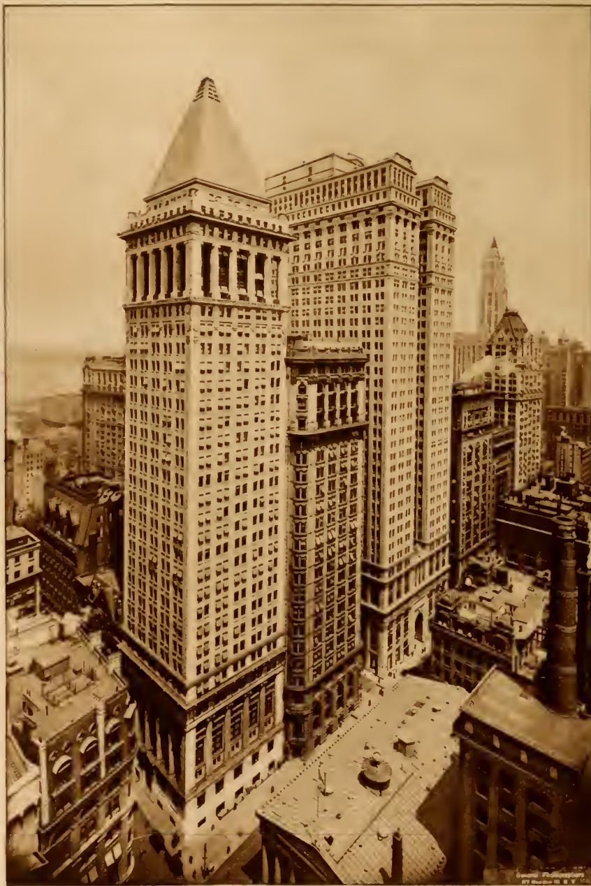
BANKERS TRUST CO. BUILDING. Wall and Nassau Streets, adjoining the Hanover Bank. Built in 1911. 39 stories and 540 feet high.